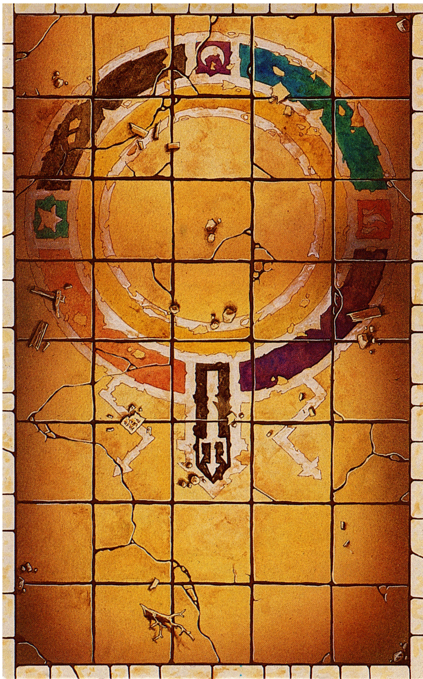
AHQ - Large Room 2