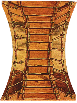
AHQ - Rope Bridge