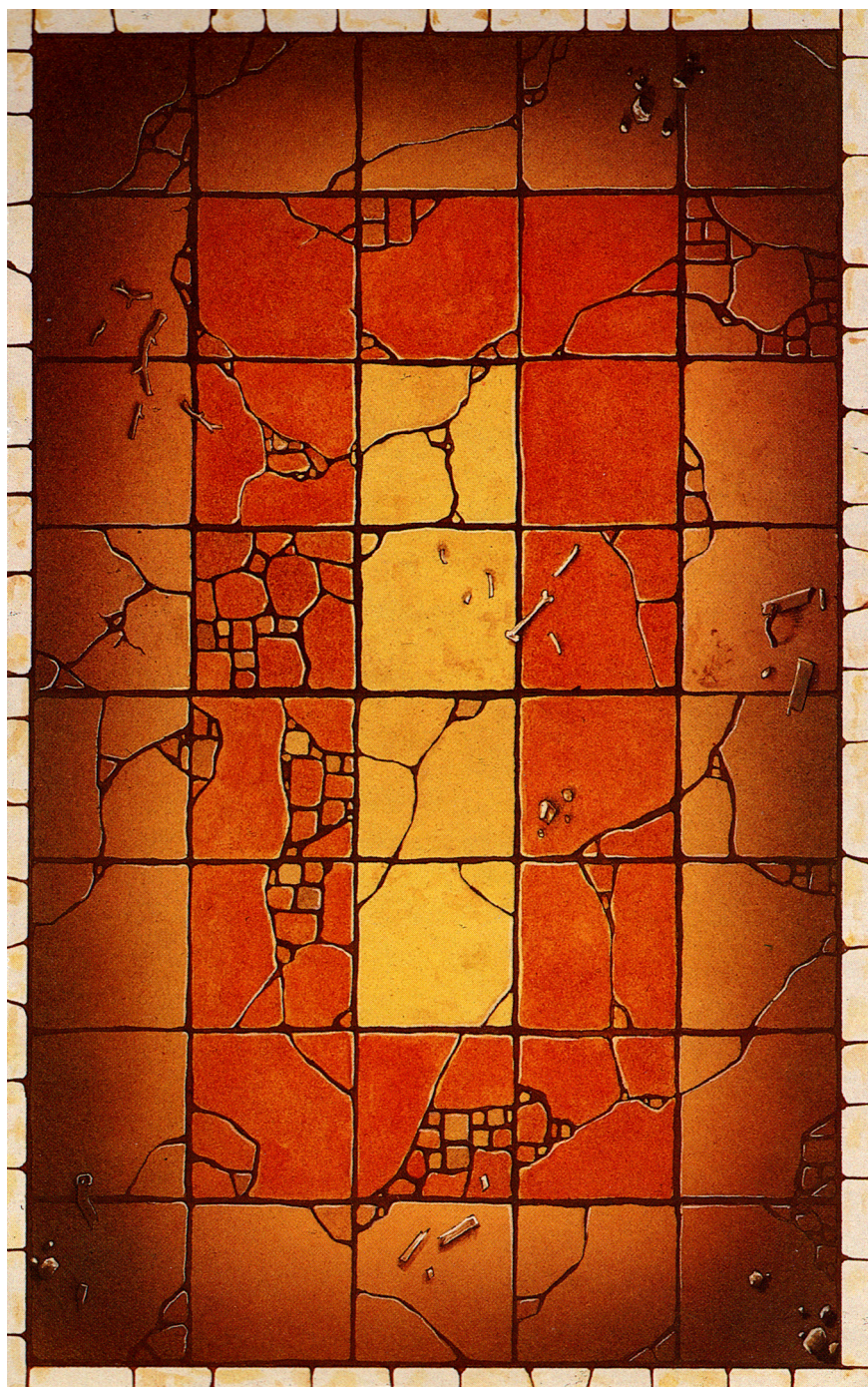
AHQ - Square Room