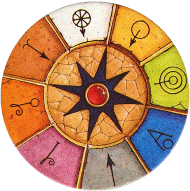
AHQ - Magic Circle