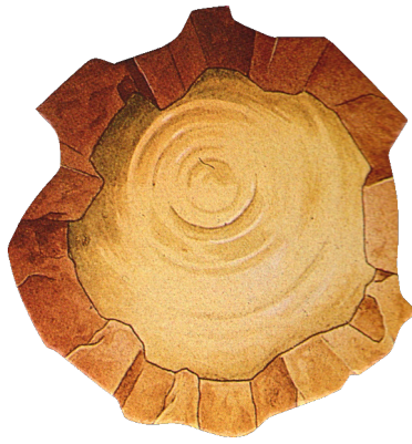
AHQ - Pool